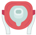
CPR pocket mask