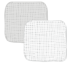
Sterile gauze pads