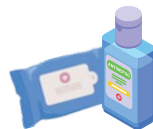
Antiseptic wipes or antiseptic solution

Review the items in your kit every 6 months and replace any items that have been used or have expired.