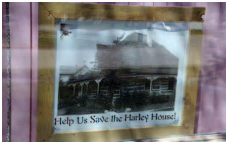
Historic photo of Harley House, Swan River.

Begin this workbook at the section you feel poses the most immediate and important challenges for your historic site. Focus on one section at a time and give this section the attention it deserves. As further challenges arise, or as time allows, you can work through additional sections of the workbook.